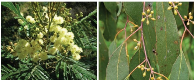
Acacia Mearnsii (left) and Eucalyptus Ovata (right) to be featured in the revegetation.

Much of the site is currently cleared, given its past use as grazing land. Up to 5000 trees and shrubs will be planted – most indigenous to the local area – to protect livestock and provide additional screening of the low-profile buildings from public view points. Vegetation will also provide new habitat for local flora and fauna.